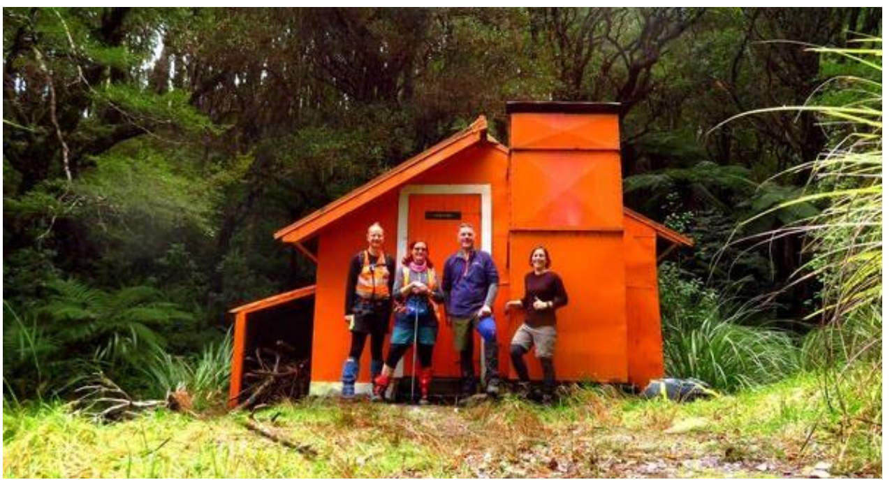
Stoat trappers stop off at Awatere Hut, Ruahine Forest Park.