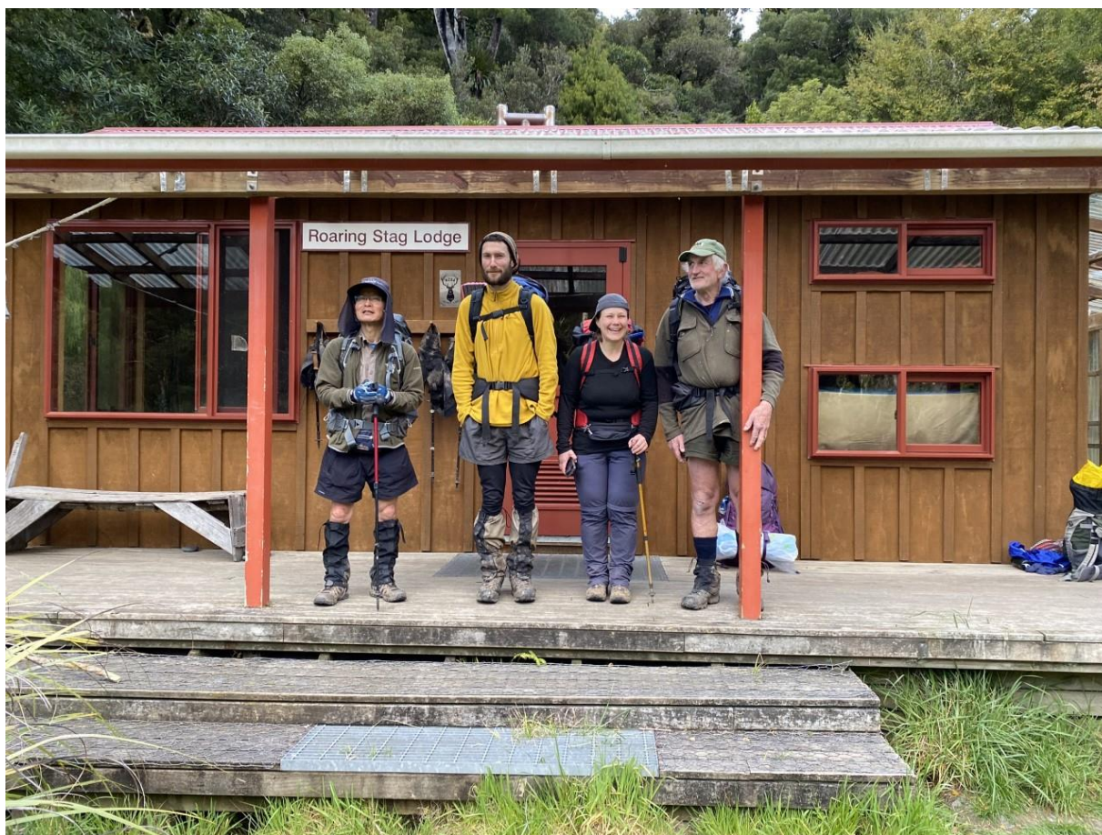
Roaring Stag Hut. The full crew ready to leave for Putara Road end.

It is great to see so many people out enjoying the outdoors and making use of the backcountry huts, but also a big realisation to carry your own shelter or a floor mattress at least just in case you are not lucky enough getting a bunk in time for the night.