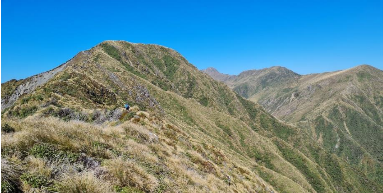
East and West Peak, blue skies and the 200m saddle.

After West Peak we thought it would be easy walking, but the way up to Walker was down and up through another saddle, followed by couple of smaller saddles and a climb up to Pukemoremore. All this time the weather was amazing and the views were stunning. We were taking our time and enjoying all the views and no wind, taking it all in. So lucky! Really pleased with the weather forecast that it held up. From Pukemoremore, surprise surprise, there was another big long saddle. Descending down into the saddle, we got rewarded with a view of Dundas Hut.