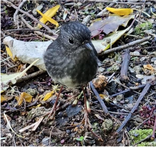
Bush Robin

We slowly walked a couple of the loop tracks. There were kereru, tuis, fantails, saddlebacks and robins. A couple of times there was a loud chattering and swooping up in the canopy, possibly kakariki.