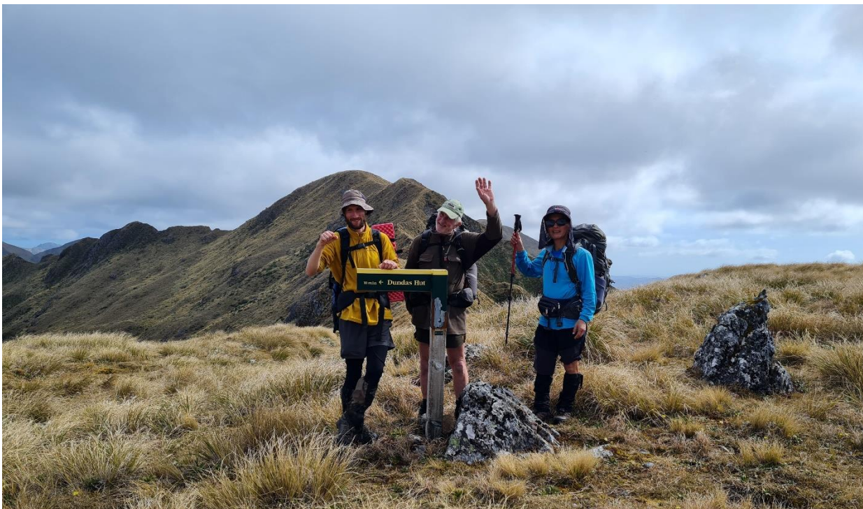
Dundas Hut Turn Off Sign. “10mins” – yeah, right.

We could also see on the far ridge the four trampers that we met at the car park making their way up to the hut. Looking how much ground we still had to cover, we knew that we will be the ones on the floor and in the tent. After what seemed like a long time, we reached the sign pointing down a ridge to Dundas Hut -10min. Not sure who made it down in 10 minutes, maybe the runners we met that “popped” down to the hut to refill their water bottles before they carried on to Arete Hut for the night, but it took us 30minutes, and some of us taking photos on the way even 40minutes, to get down.