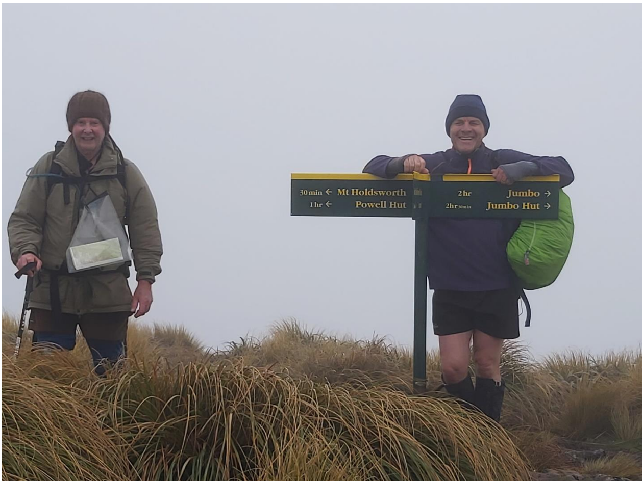
Top of the East Ridge Track, Mt Holdsworth, Tararua Forest Park – report inside.