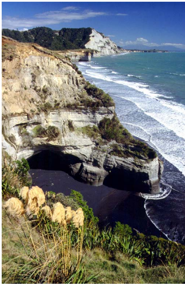
"Tongapurutu cliffs"