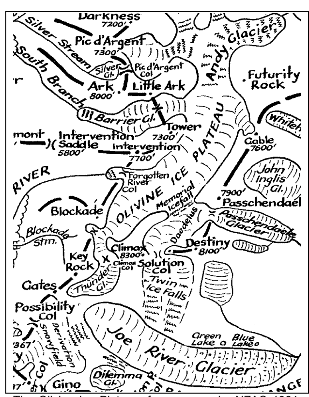
The Olivine Ice Plateau, from a map, by NZAC 1964. NB The plateau is about 1 km wide. Also note that all of these glaciers have shrunk considerably recently.

Last summer, a few club members, and friends, visited the alpine wilderness of the Olivine Range, in Mt Aspiring National Park, and did some good climbs. Here is their story.