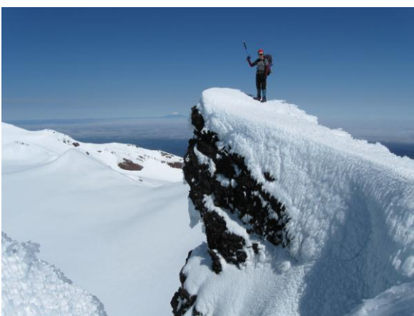
One of twin summits of Tukino

each of the two summits – room for only a couple at a time though, with big vertical drop offs onto the plateau! More sastrugi, as we dropped down to the saddle and up onto Te Heuheu (2732m). (As an aside, Te Heuheu Tukino was the chief that gifted the top of Ruapehu to NZ way back.) So a total of six peaks over the two days!