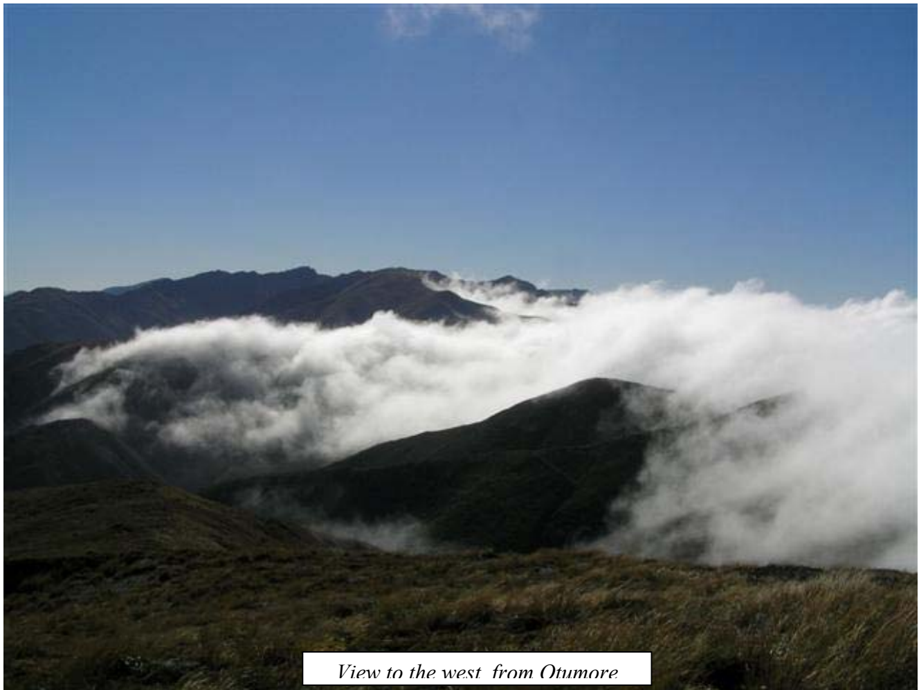
View to the west from Otumore