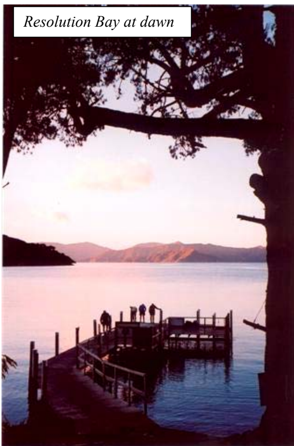
Resolution Bay at dawn

tramping groups. Ian excelled himself with his speciality of bacon and prunes cooked in Coca Cola. We were all impressed.