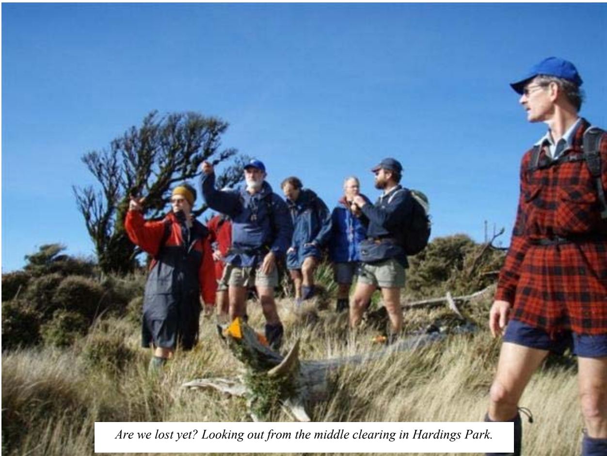
Are we lost yet? Looking out from the middle clearing in Hardings Park.

us with a pleasant lunch spot. The track south from there was marked a little, and would be confusing to follow in mist or darkness. Someone suggested that we needed a mountain running event to allow a few hundred runners to dash past, so marking the ground trail a bit better. The bush was a bit open in places, and the terrain fairly flat. It was a short, steep descent to the scenic Otangane stream, then back up the other side to return to the Sledge Track. Once there, and descending to lower and more sheltered altitudes, it became markedly warmer and more crowded. A good stroll back along a very familiar trail beside the Kahuterawa Stream to the cars.