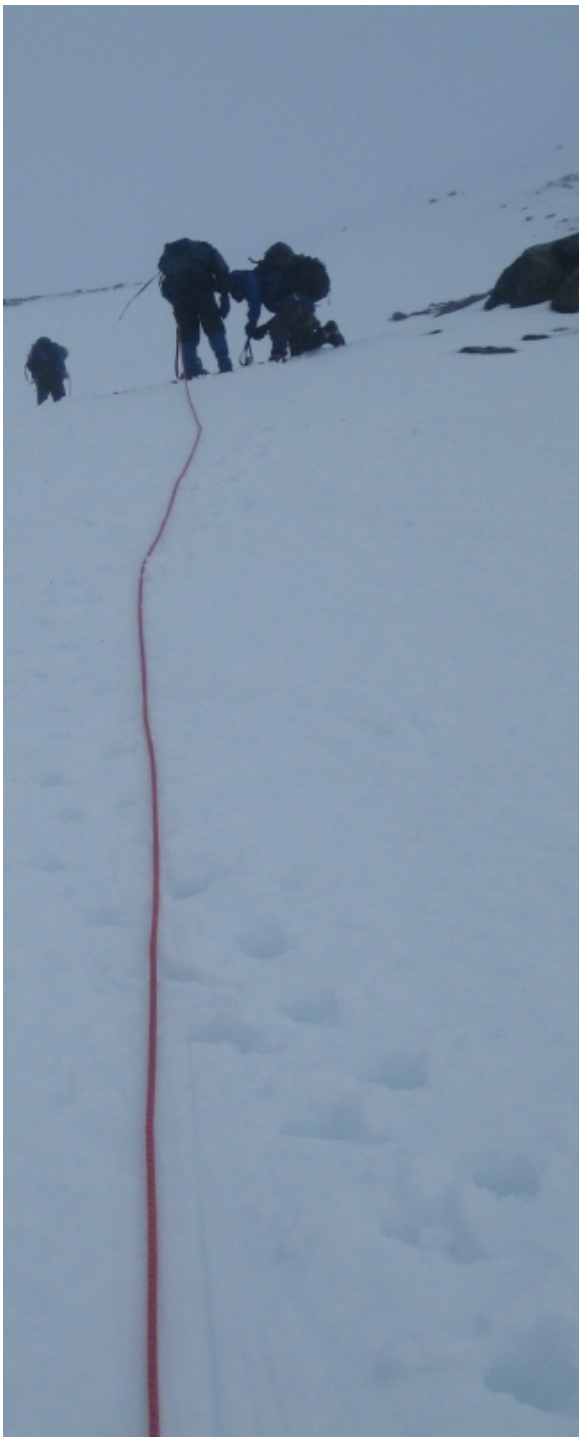
Snowcraft on Taranaki

A great weekend had by all and some great skills learned as a bonus. Lots of thanks to our experienced instructors – see you on the mountain.