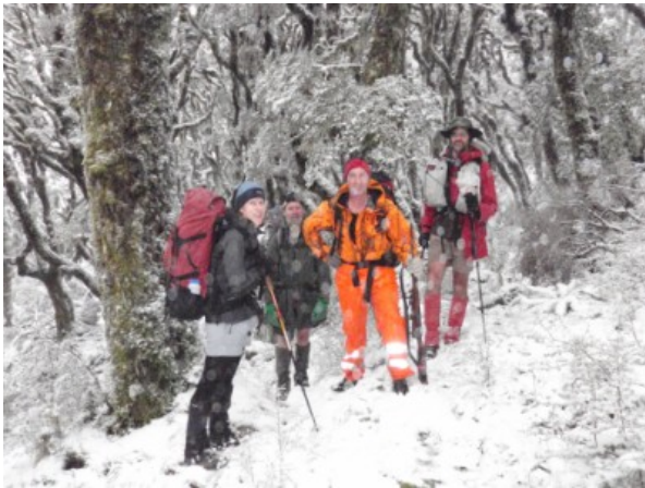
PNTMC on the Blue Range track.

lunch. The hut was a great place for a lunch stop.