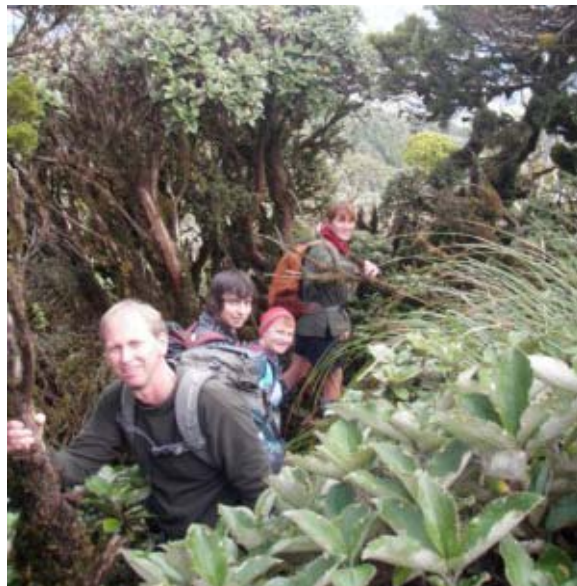
On the leatherwood track.

back to the road end. Having eyed the top of the Ruahine Range from the drop off position and thinking that it wasn't much further up in height (200m), a trip up here with that aim in mind should be done. The challenge of course was the Leatherwood, which is prolific up here in the southern Ruahines.