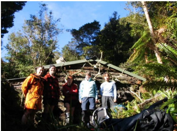
PNTMC at the Punga Hut, Patupairehe Stream. Note hut construction and antler collection.