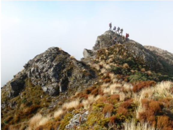
On Rocky Knob- a special place.