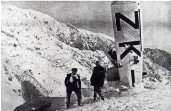
Hamish Armstrong's Tiger Moth crash, Armstrong Saddle, July 1935. Te Atuaoparapara behind.

Air Force NZ 2127 Oxford Airspeed crashed on 30 November 1948 near Howletts Hut with three fatalities. There was another extensive search and body operation, with considerable publicity.