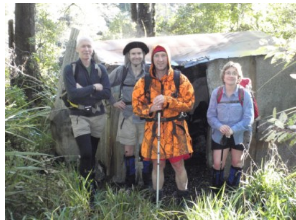
PNTMC at Black Stag Hut, Makaretu Valley.

The Makaretu Stream offered good travel, but we returned to Awatere Hut, took an early coffee break, then set off up the big hill to Rocky Knob. Two and a half hours of bush and scrub travel saw us on the top, with most of the route being relatively easy. Dave had checked this ridge out during the previous summer, so we knew that even the much vaunted leatherwood belt wouldn't present too much of a problem for us.