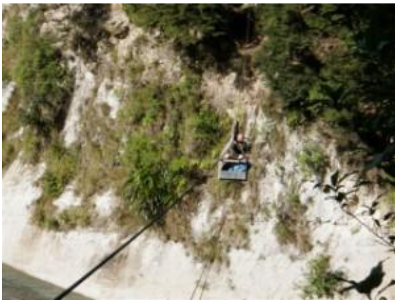
Crossing the impressive Kawhatau cage.

This was the first time I had been into these two huts (Craig had been into Crow Hut a few years back but not to McKinnon), so with fine weather forecast I was looking forward to checking out the area. We headed off from Kawhatau Base car park following the track to the cableway - the other track option of wet feet crossing the river lost out. After reading the instructions I climbed into the cage and Craig let the wheel go and I sped off eventually coming to a halt above the river. As the cage hung there motionless while I took in the view, I wondered why he wasn't winding me across? Okay he's got his camera out to take a photograph, then he wound me across and I returned the favour.