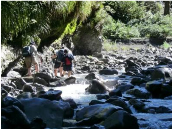
Tramping the very sunny Waipawa River

folks heading down seemed to prefer a pace that was far in excess of ours, and I do not think that ours was particularly leisurely.