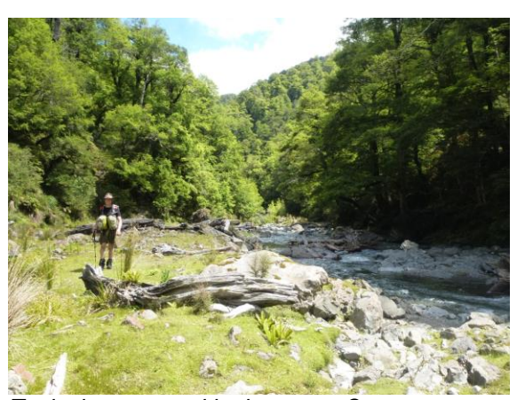
Typical easy travel in the upper Oroua.

At the saddle you meet the well-worn path again. Warren and Graeme continued north, dropping down to the river. I did a quick trip trap run to the south towards Iron Gate/Oroua River. There was a big trout to watch in the pool by the last trap. It's a steep grunt back up this track so I left the rebaiting until the uphill bit - I've heard it said that one of the good things about working with traps is being able to stop every 100m! W & G had gone off for a look downstream for ducks but had left me a radio (GR is known for being particularly well equipped) so I called them up and they abandoned their search - deep pools making for slow travel. The river from here to Triangle Hut could be described as delightful apart from one or two awkward bits. The upper section has much more gravel and is shallower than I remember. We were well over manky rotten rats by the time we reached the hut around 2.30.