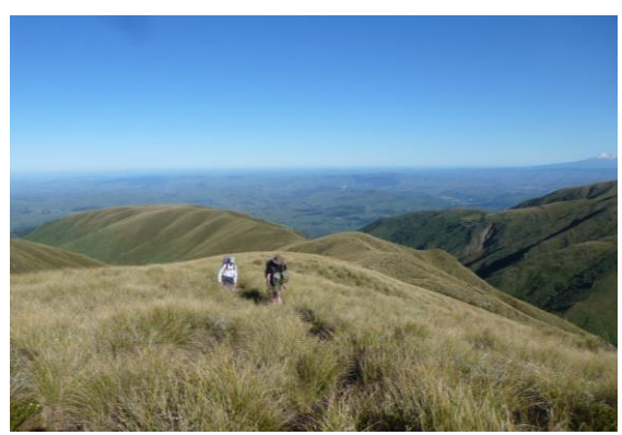
A great day to be on the tops.

ridge - it's not marked and we had our compasses out.