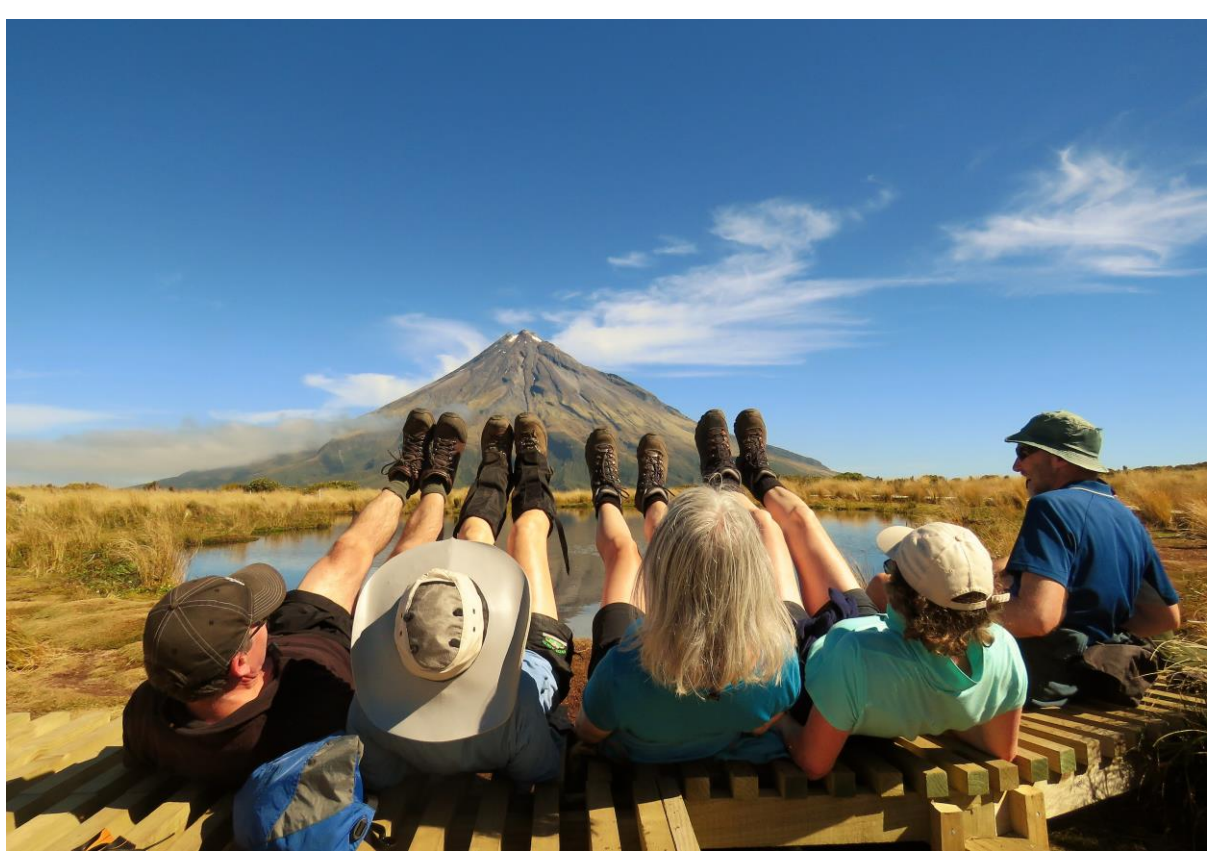
Putting our feet up with MTSC friends on the Pouakai Circuit, Egmont/Taranaki.