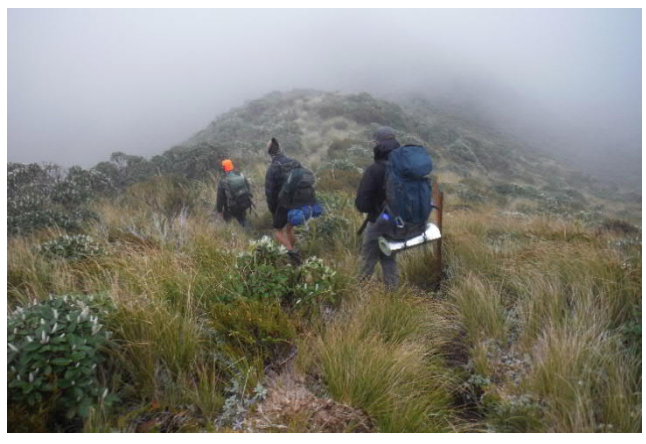
Homeward Bound down Knights Track