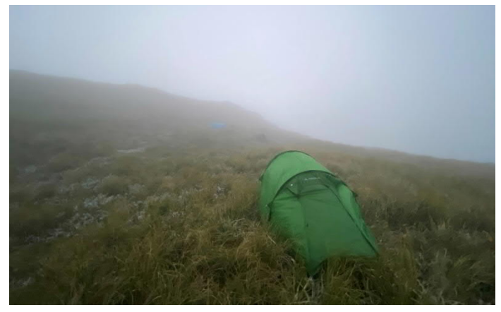
Not quite a thrilling sunrise!

We had decided to wake up early and get a reasonably early start – hopeful that the cloud had burned off and a sunrise might be visible. No luck on that front, either. After a chilly night (my phone said 3C when I woke up...) we ate a quick breakfast, packed up, and got ready to roll back down Knights Track. The return via Knights track was more direct than Shorts and was quite pleasant the whole way down. The one exception to this might have been Warren's scaretactics (or generally sound advice) in terms of plane-crashes, storms, and missing trampers in the Tararuas! Getting back into the forest, the weather was fine and warm. Perfect weather for a casual descent to the road end!We got back to the car park nearing 10:00am – we had made good time. Despite being misled on a few fronts – no sunset, no sunrise, cold – it was a nice