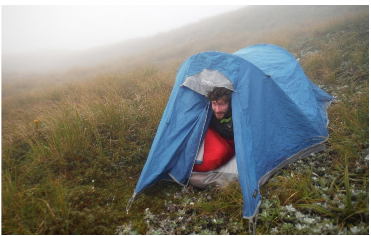
A cosy bed just below Toka Trig (see the full story in the trip reports)