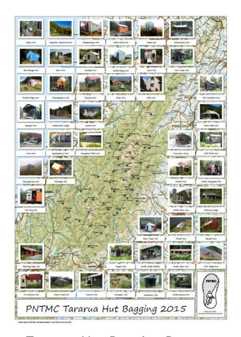
Tararua Hut Bagging Poster

Posters are still available for both the Ruahine Huts and Tararua Huts that were produced following our Hut Bagging Challenge in 2012 and 2015 respectively.