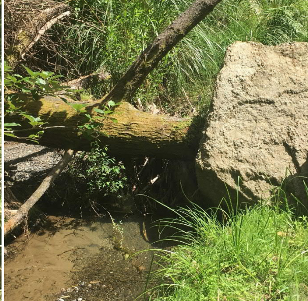
Up the creek