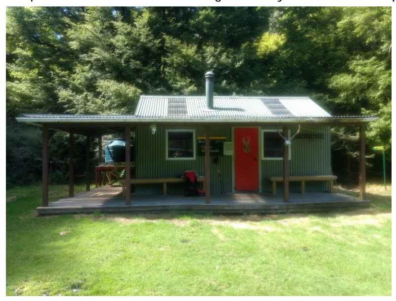
Upper Whirinaki Hut

The whole circuit was just over 80 kms. Two thirds of the tracks are easy on graded and benched track. Some can be biked. The remainder is back country tramping. I started from the plateau car park which is accessed through forestry roads off the Napier Taupo Highway.