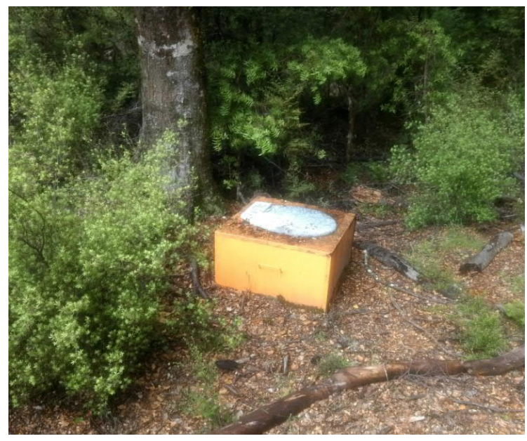
The bare essentials long-drop toilet

about the consequences if I was to fall off. A couple of people were at the hut and another couple turned up while I was there having my lunch.