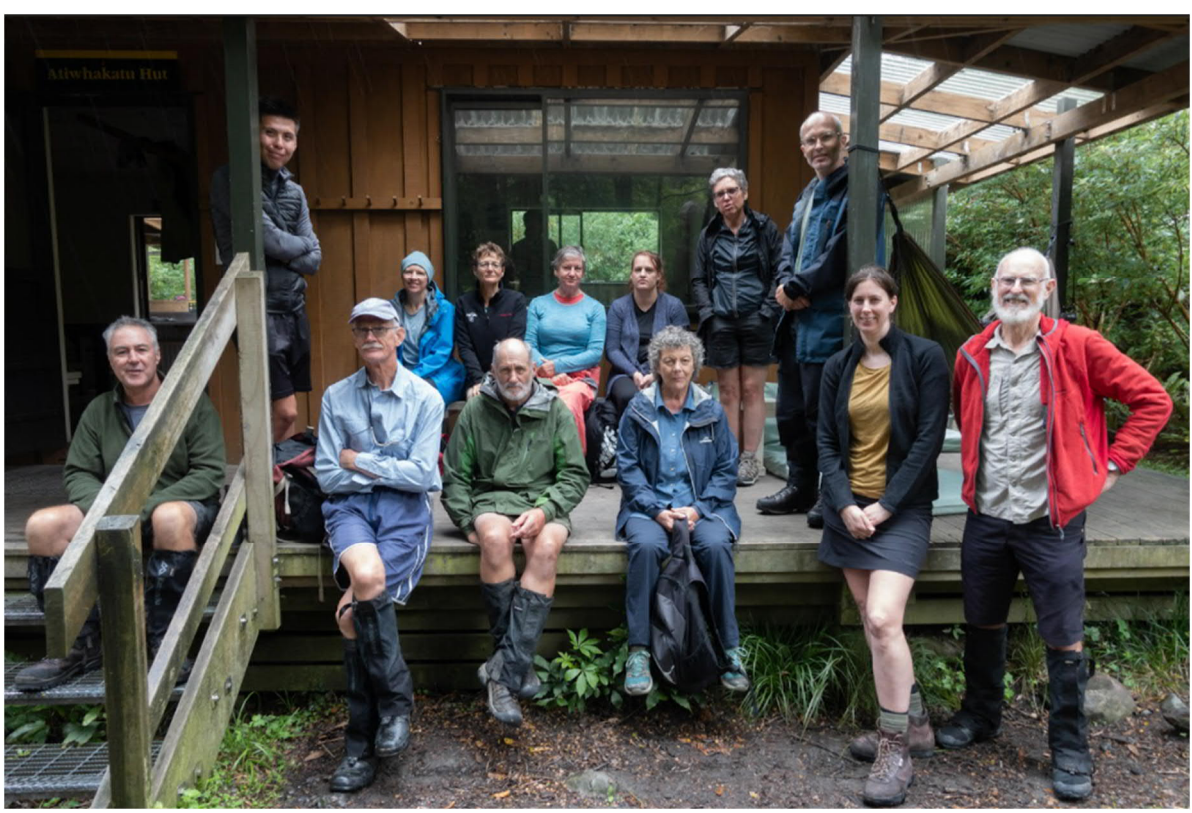
The first beginner tramping party this year at Atiwhakatu Hut