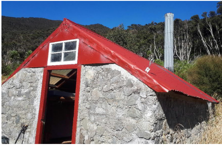
Stonewalled Shutes Hut

Day five saw our party retrace our steps to visit historic Shutes Hut. It is stonewalled and was inhabited in isolation