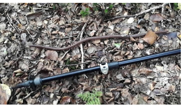
7 Big native earthworm, maybe Maoridilus Montanus

There is a clear sign where the track to Iron Gate Hut turns off the tops. However, a bit further down (quite a while after turning off) you have to make sure you catch the correct ridge to follow. It is not too difficult because the track disappears after a little while and you realise that you might have missed a turning. For a long while the track still runs through tussock before it goes into small vegetation and then a bit of leatherwood. Then the track becomes a wide, nearly