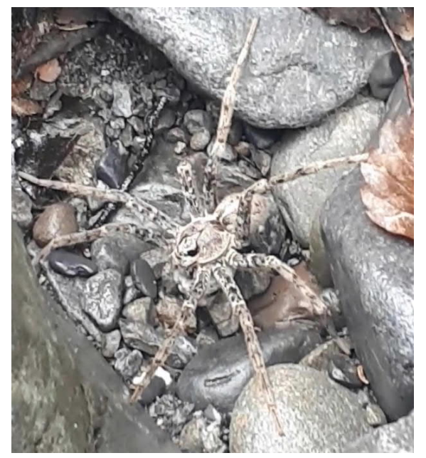
10 Dolomedes donsalei in Orua river bed.

We came down the river to Tunupo fly camp and then we went on to the track between Iron Gate hut and Alice Nash hut. We followed the track to Alice Nash hut where we had a short lunch at around 1pm. From there we returned to 99 Peterson Rd. just after 2pm.