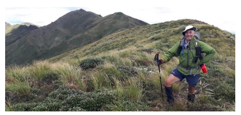
4 Looking back towards Tunupo after lunch.

After a while when the tops flatten out there is an area that is more wet with small bogs and very low vegetation. It became more difficult to find the track and the traps, so