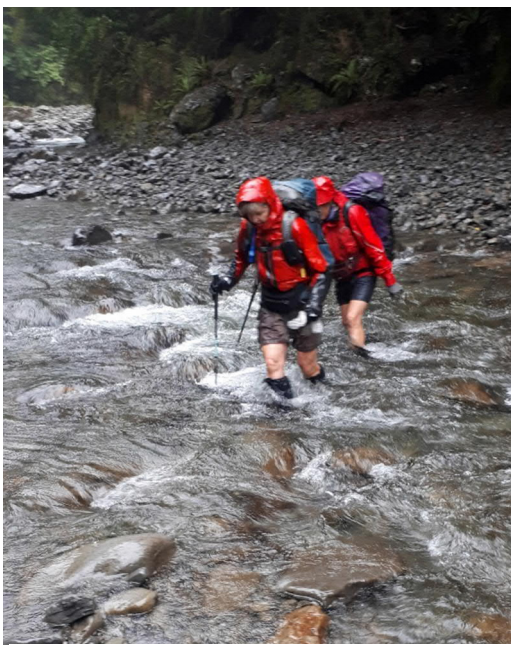
9 crossing Orua river in the rain.