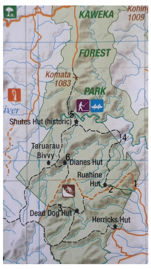
South of Kaweka Forest Park is the Northern Ruahines. Numbers 1-6 show the route from Ruahine Hut to Shutes and Dianes Huts, with a side trip to Dead Dog

Access was via a rough 4WD track in Graham's rugged motor transport through Big Hill Station up Big Hill Road ( shown as '1' on the map ) to Ruahine Hut ( shown as '2' on the map ). The latter was occupied by hunters. This was of no great concern to our party. We had preplanned to camp there, amongst shaded tree cover. Since we were a hardened group of Kiwi trampers,