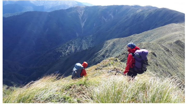
3 Descending from Tunupo. Looking along the ridge.

Tunupo track is lovely. It is uphill all the way but there are flatter sections. There are places where you would normally see and hear lots of birds but on this trip, we did not hear many on the way up. However, we did hear the native Grey Warbler, Whitehead and Tomtit. When we came above the tree line, we were pleased that the wind wasn't too strong. We were maybe too quick to be pleased because the wind got up when we came nearer the top of Tunupo. We arrived at the last trap on Tunupo track (at the weather station) around 11:45. It was now very windy and we put on a fleece and our jackets to keep warm. We decided to have lunch at the next spot where we could find some shelter.