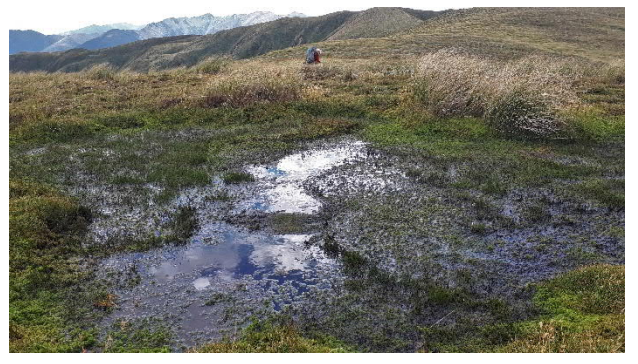
5 Rebaiting a trap near the bog.

we spread out to try not to miss a trap, but we did miss one trap.