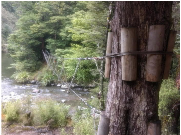
Walkwire minus the safety net

considered staying there the night but went over my map and came up with a circuit that would give me a shorter walk for the rest of the day but could end up with me visiting 12 new huts. So up the hill to Ballard Hut was the next section of my journey and where I would stay for the night. I arrived not long before it started to rain heavily. It is a small four bunk hut and I was there alone until a hunter and his girlfriend arrived.