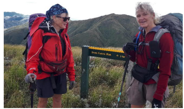
6 At the top where the track to Iron Gate Hut turns of. (a quarter past 2pm)