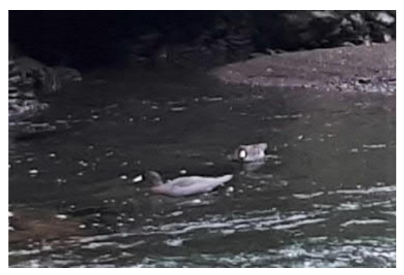
11 The pair of Whio

It was lovely to get some dry clothes on and enjoy a bit more lunch in good company. It was a wonderful trip; beautiful views from the tops,