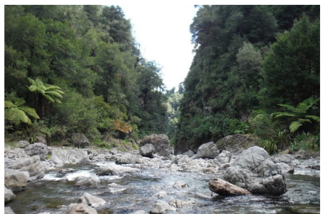
Iron Gates Gorge hiding behind some big rocks.