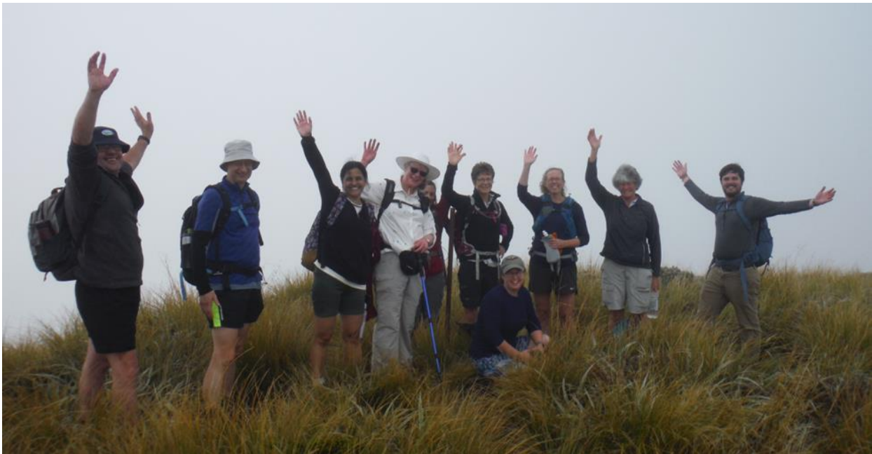
Mangahuia Hi Point - views we have none, but happy to be here.