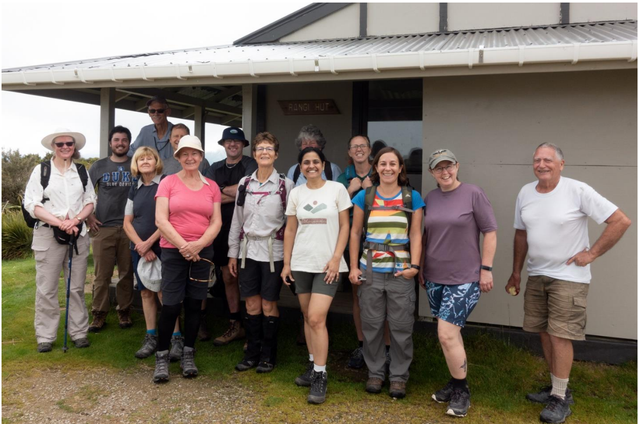
Beginners Tramp #2 at Rangiwahia Hut, Ruahine Forest Park.