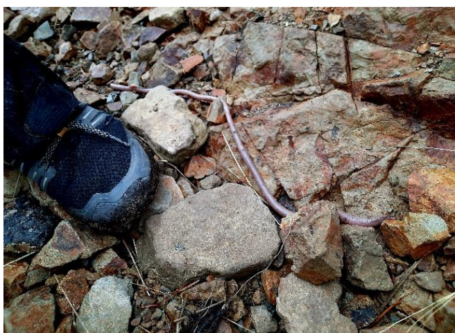
Spot the giant earthworm.

As it was only 11 o'clock, and not really lunchtime yet, some of the group checked out the beautifully decorated toilets and then we all headed off to the tops. It was stunningly calm, not at all damp and we were surrounded by great views.