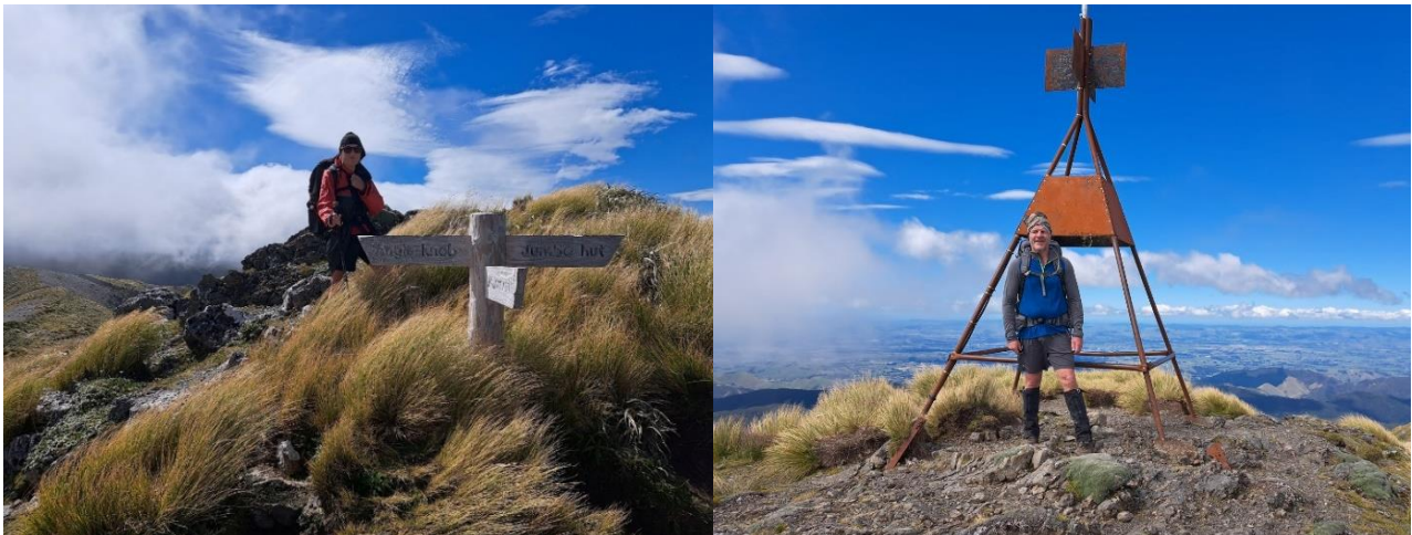
A bit windy and looking cloudy up ahead, but.

The popular YrNo forecast often seems the most pessimistic (or is that realistic). Anyway, to cut a long story short about the pros and cons of the various forecasts, by the day before Blair and I had come to the conclusion that the forecast was less than ideal. We cut our planned 3 day Maungahuka trip short to the much easier Jumbo- Holdsworth Loop and booked a couple of spaces in Jumbo Hut for the Friday night.