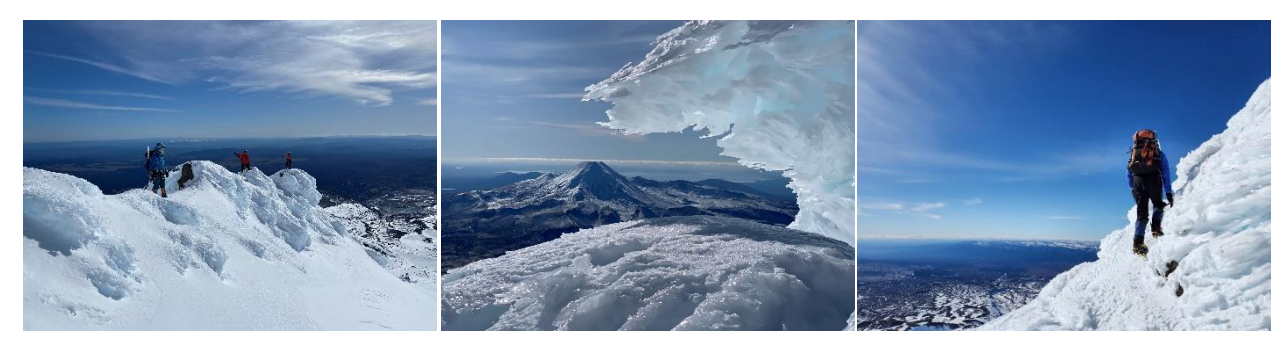
Along the Pinnacle ridgeline

With moderate avalanche risk we were careful to assess the aspect of slopes climbed and stick to the ridgelines where possible. This led to walking over some