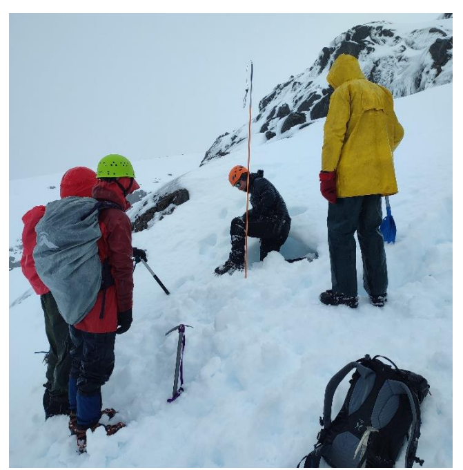
Avalanche probe test to find missing person.

We then buried a willing course participant and practiced finding him with a snow probe (can we tell the difference between a rock and a person?).