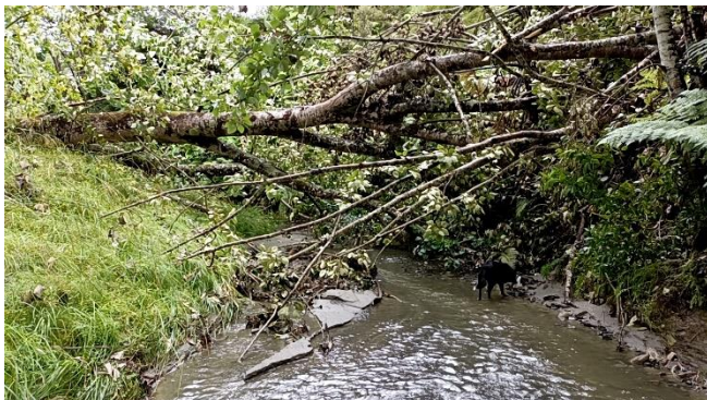
Windfall – not so good