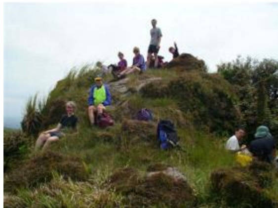
Lunch Spot with View of Palmy