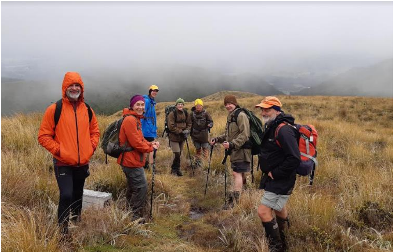
Wondering if the clag will lift on Rangi-Deadmans Loop, Ruahine Forest Park