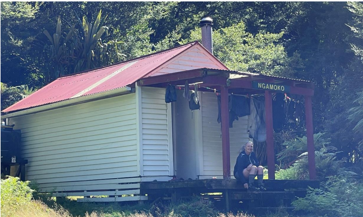
Nice Job at Ngamoko Hut