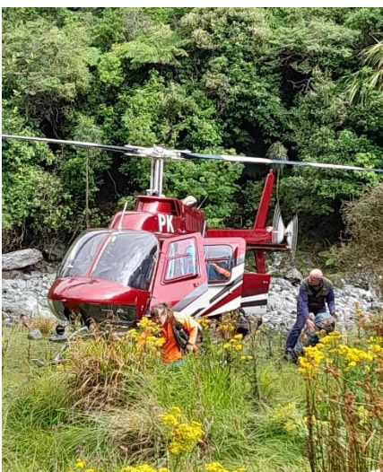
One of many helo loads