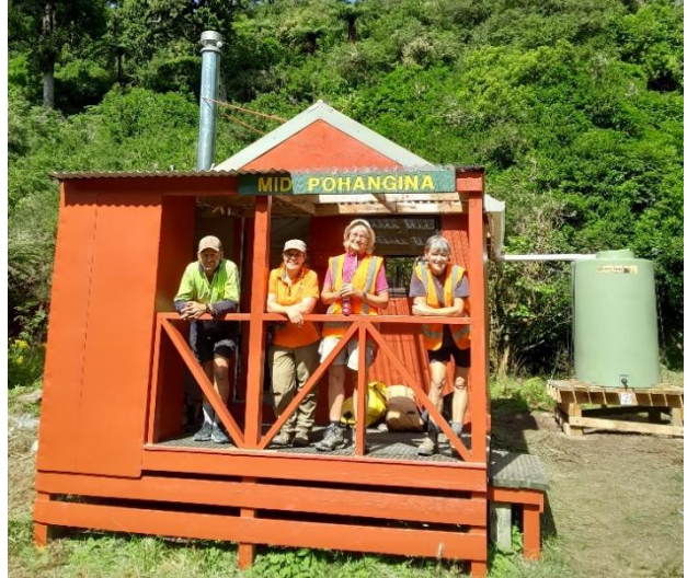
New colour scheme and water tank.