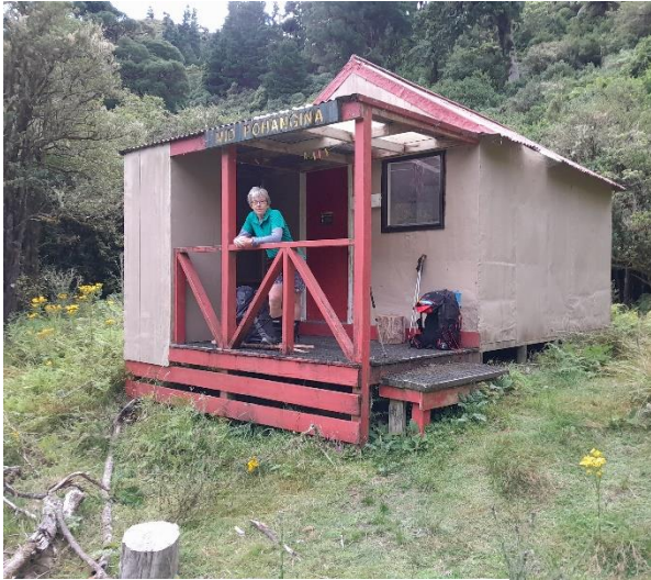
Before the makeover