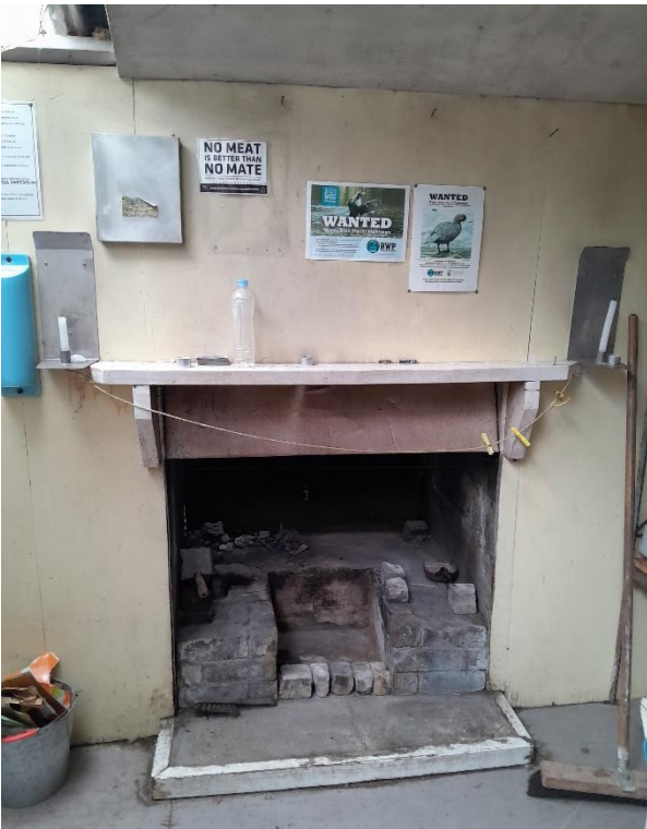
The old fireplace